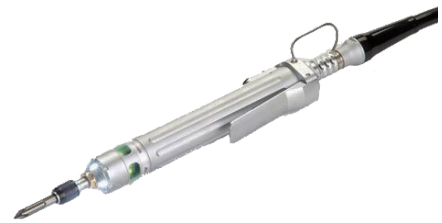
PL model Push or Lever Start