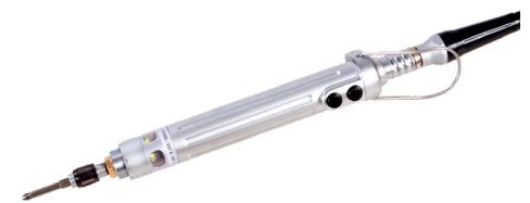
FX model Threaded End