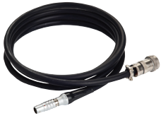
ASG-CB2500 Heavy Weight Strain Relief (HW)