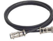
ASG-CB2500 Extension Cable (EX)