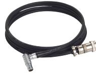
ASG-CB2500 Right Angle (RA)