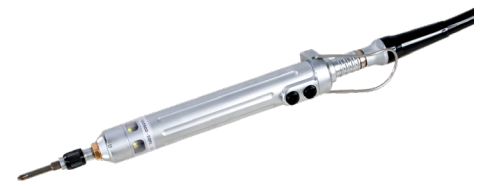
PS model Push To Start Only